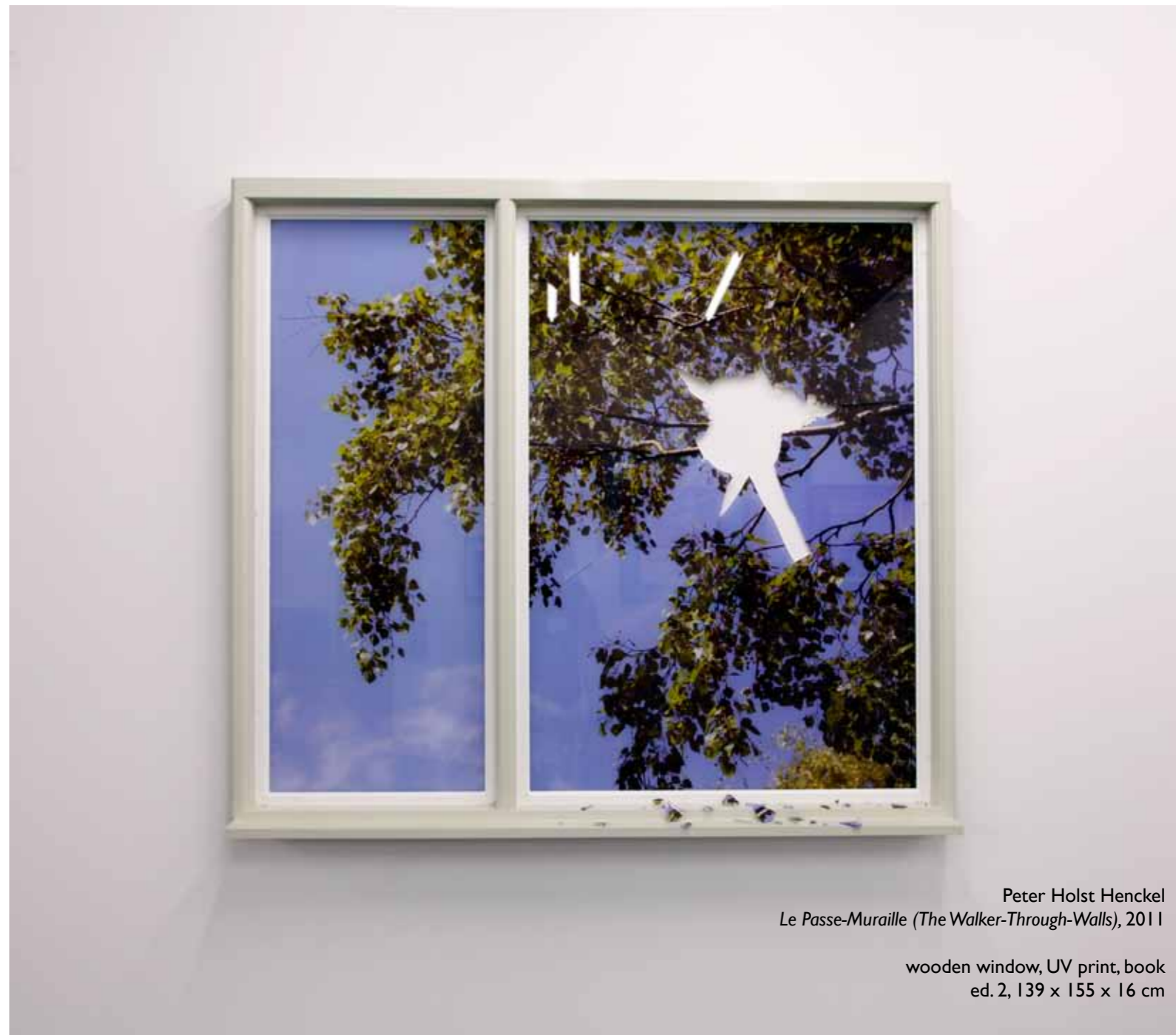
Peter Holst Henckel Le Passe-Muraille (The Walker-Through-Walls) , 2011

wooden window, UV print, book ed. 2, 139 x 155 x 16 cm