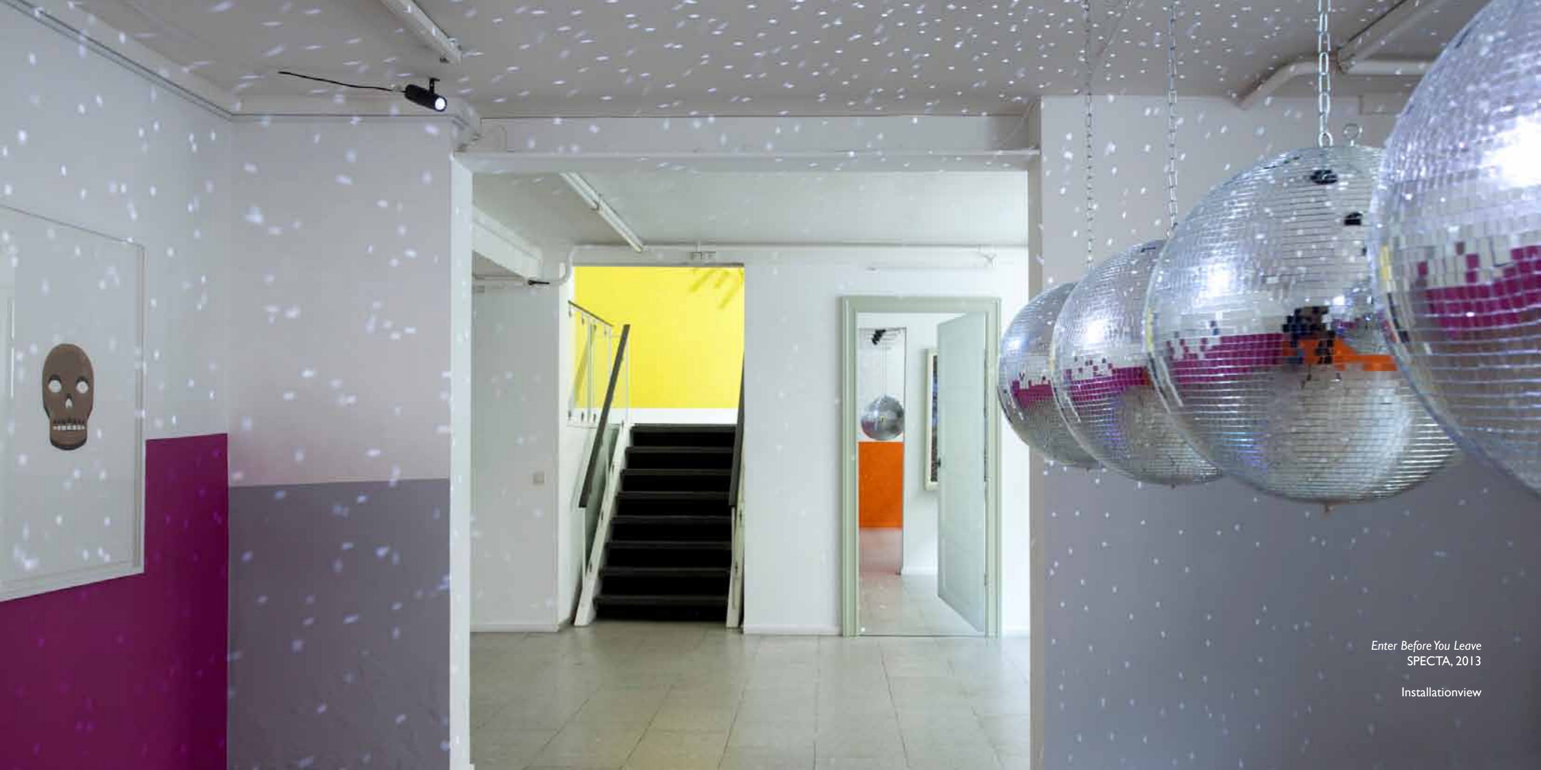
Enter Before You Leave SPECTA, 2013