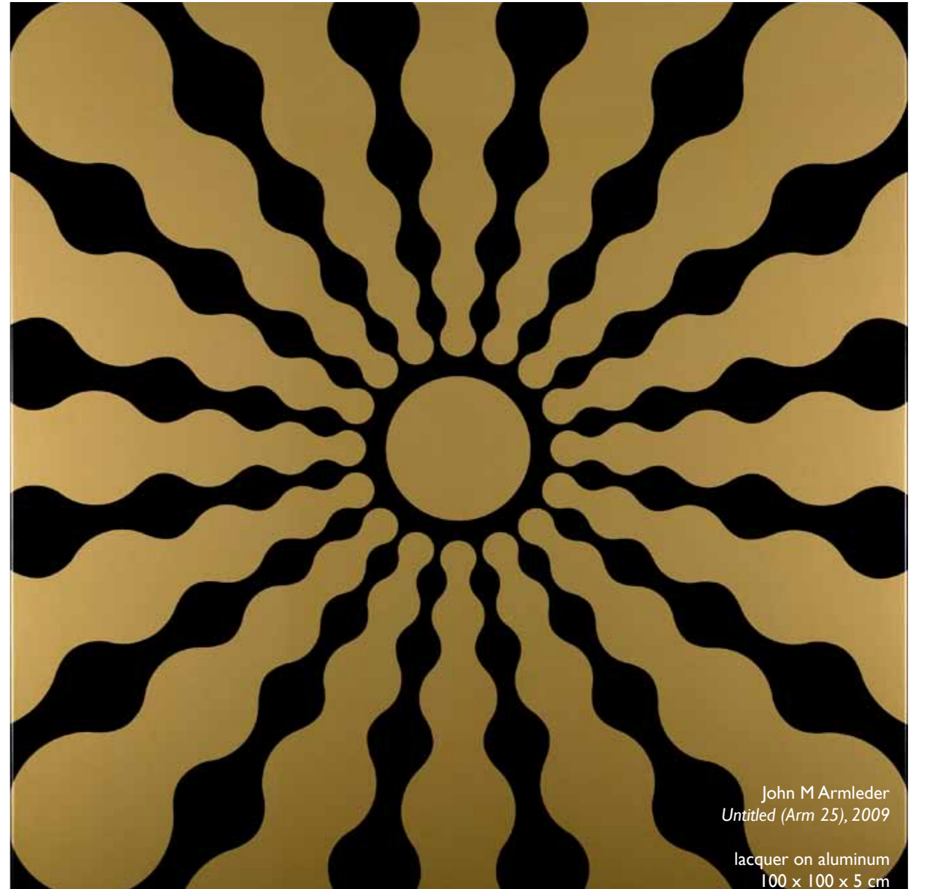
John M Armleder Untitled (Arm 25), 2009