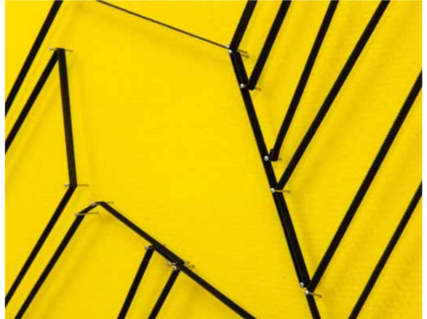
Yonatan vinitsky What do Attract and Repel Mean ???? (4 chairs), 2012