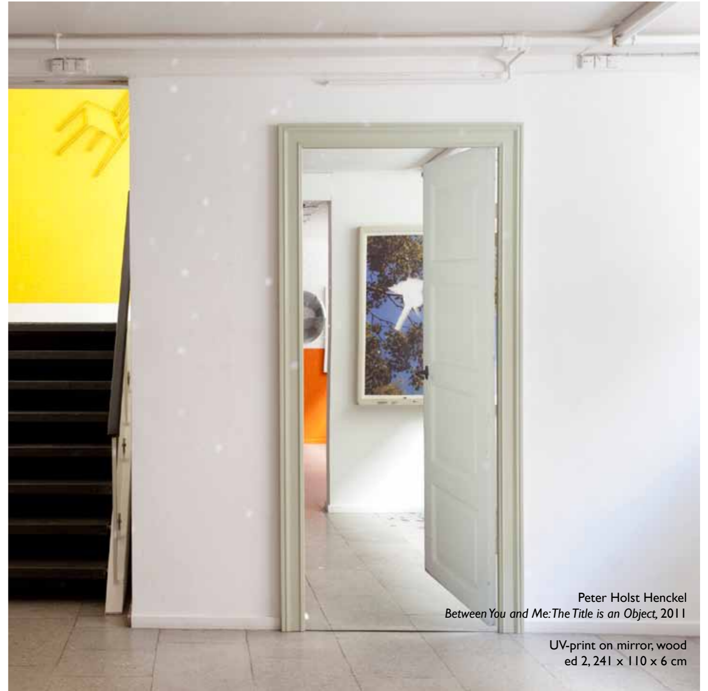
Peter Holst Henckel Between You and Me: The Title is an Object , 2011

UV-print on mirror, wood ed 2, 241 x 110 x 6 cm